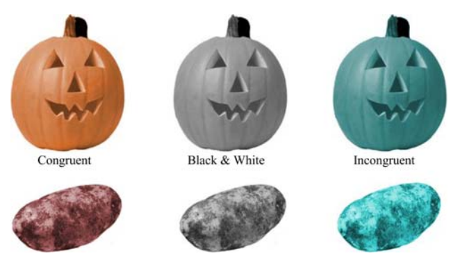
Fig. 1 Example stimuli

The 96 pictured objects were scaled to occupy a square of approximately three inches (72 pixels per square inch). We used the program Adobe Photoshop for all image editing. Images were modified uniformly by removing all color information using a mode transformation to grayscale. Color information was then reapplied to the objects by overlaying a translucent layer of color according to the standard RGB value for each color (blue, green, red, cyan, orange, brown, yellow, purple, pink, violet, or teal). By applying the same colors to the objects the variability of similarly colored objects (e.g., the difference between the orange of a pumpkin and of a traffic cone) was removed. Three levels of color (neutral, congruent, and incongruent) were varied across all pictures. Twenty-four of these pictures were experimental items (i.e., color diagnostic objects). All pictures appeared against a white background. A listing of all color diagnostic items is presented in the Appendix.