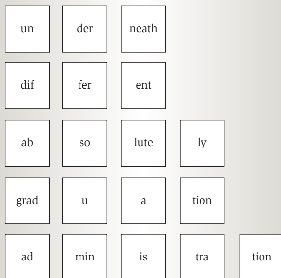
Figure 3. Manipulating Syllables on Individual Cards to Arrange Them Into Words

ency, and comprehension can all be addressed in the lesson.